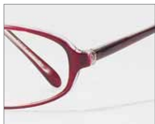
Bella Flex 1