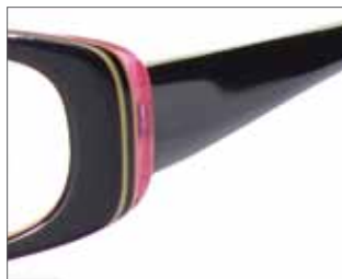
Whiz Kid 32