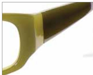
Whiz Kid 31