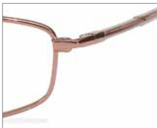
Pure Titanium 32