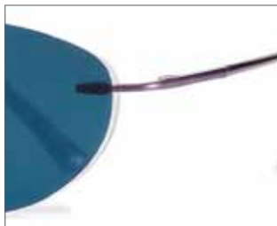
Wall Street 702 / with clip