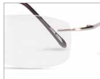
Manzini Thin Air 17