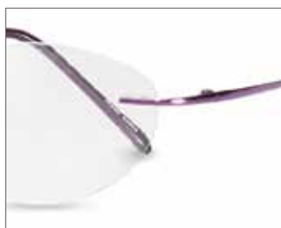
Manzini Thin Air 16