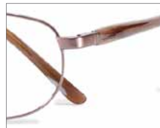
Dyna Flex 2