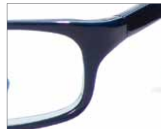
Whiz Kid 33