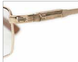
Wall Street 602