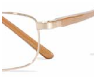
Dyna Flex 1