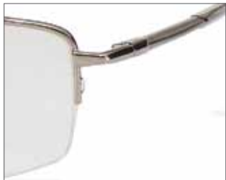
Pure Titanium 34