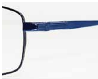
Wall Street 603