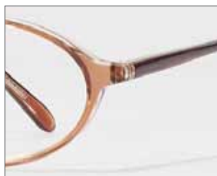
Bella Flex 2