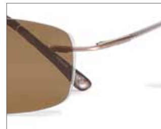
Wall Street 703 / with clip