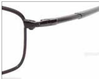
Pure Titanium 35