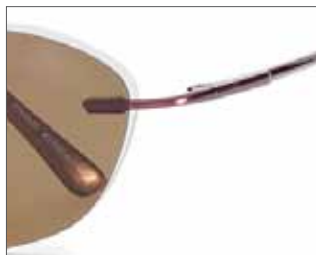
Wall Street 701 / with clip