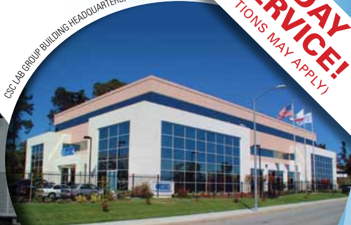
CSC LAB GROUP BUILDING HEADQUARTERS, WATSONVILLE CA