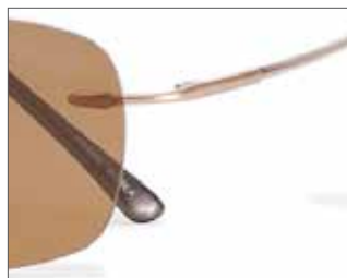
Wall Street 704 / with clip