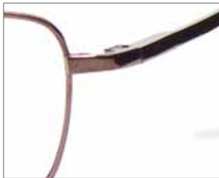
Pure Titanium 38