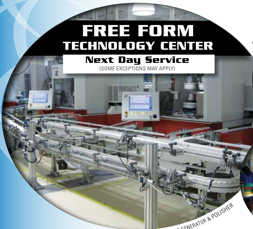
FREE FORM ROBOTIC GENERATOR & POLISHER