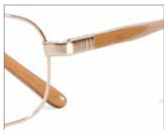
Dyna Flex 3