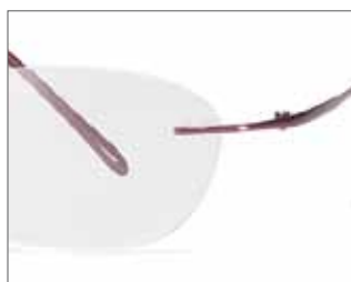
Manzini Thin Air 14