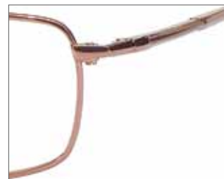
Pure Titanium 33